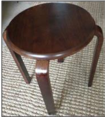
Wooden end table; $6