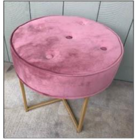
Dusty Rose Ottoman, 19" dia. x 18" high; $10