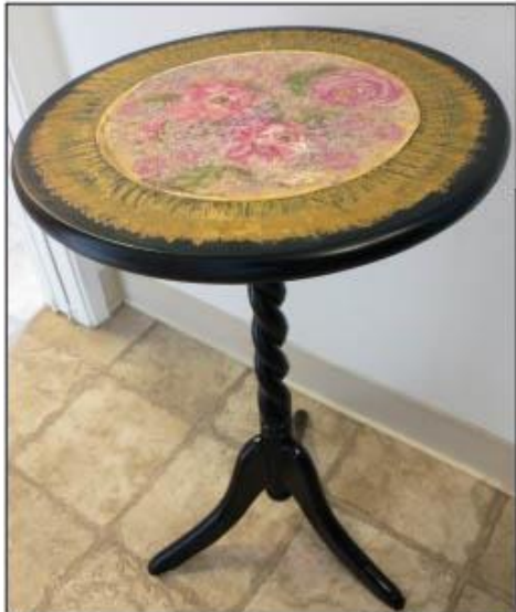
Hand-painted rosy accent table; 15" dia. x 25" high; $12