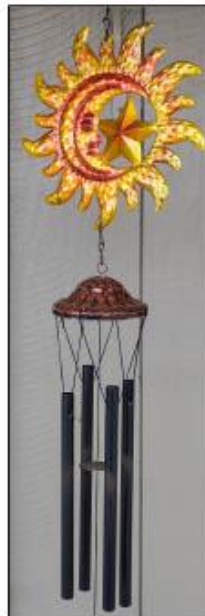
Wind Chimes or Metallic Cow Birdhouse, your choice! $3 each