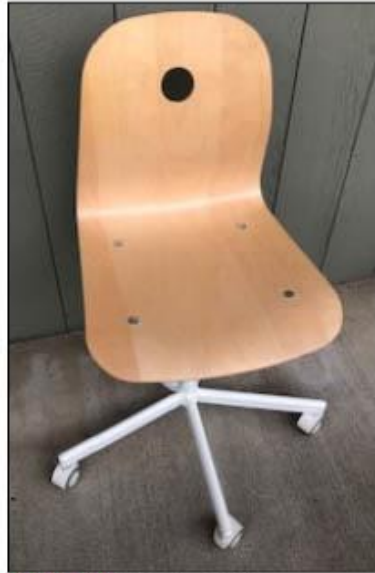
SALE! Bentwood desk chair; $20 now $15