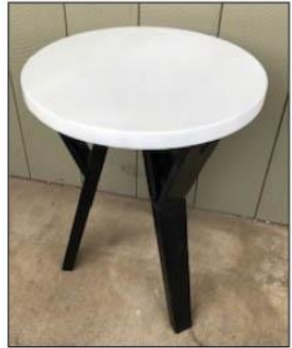
Round black & white side table; 18" dia., 24" high; $15