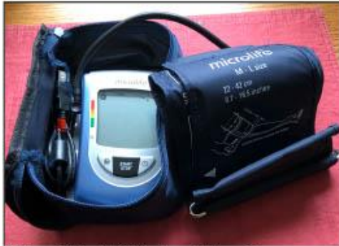
Microlife M-L size blood pressure Monitor for arm; $10