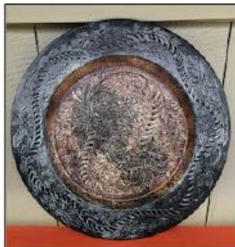
Decorative plate; $5