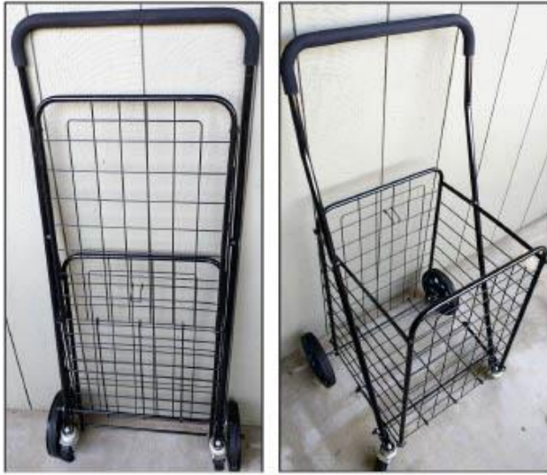
New Rolling Cart – folds for storage; $10