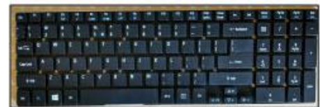
Electronic keyboard; $5