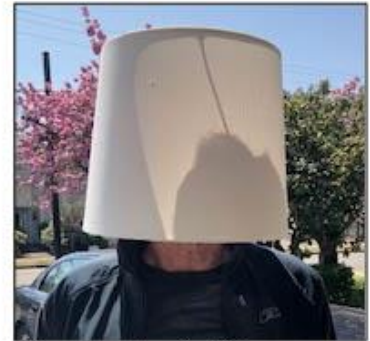
Lamp shade $5