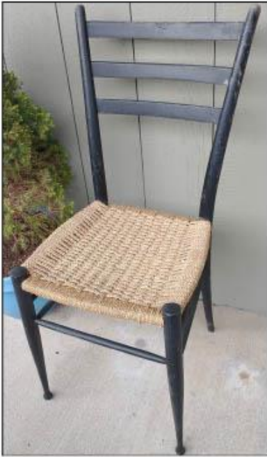
Wicker chair, needs TLC & paint; SALE! $7 now $5