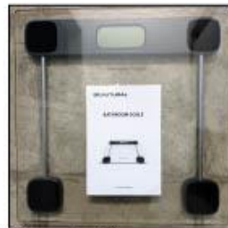
New bathroom scale $7