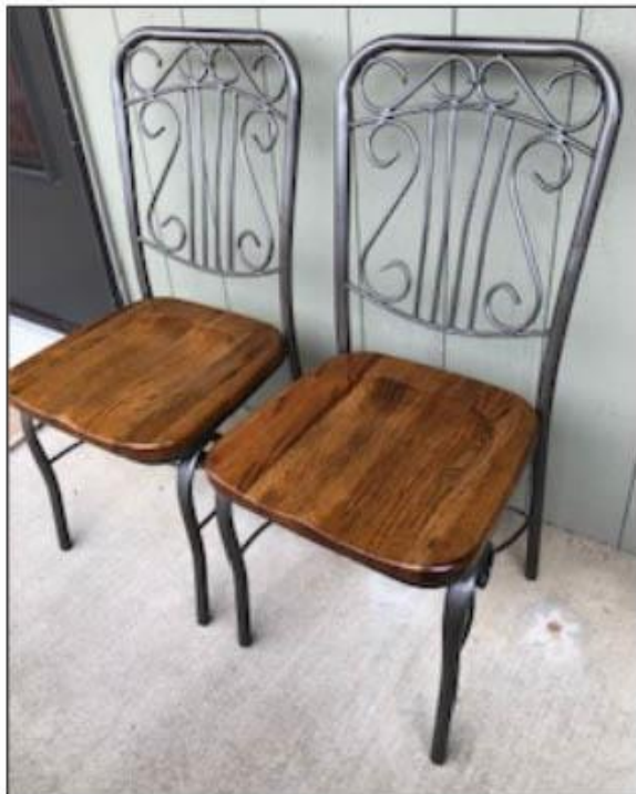
SALE! Set of two dining chairs; $30 now $25