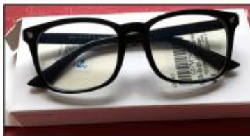
Blue lite filter glasses; Brand new; $7