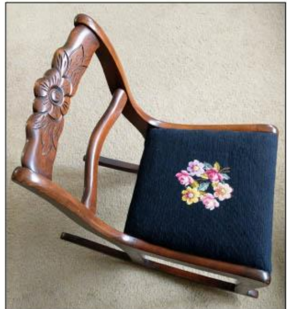
Vintage Duncan Pyfe rocking chair. Carved wood back with needle-point seat. In good condition; SALE! $30 Now $25