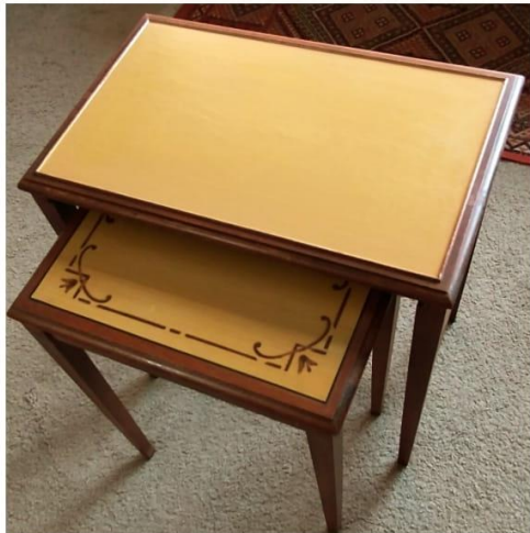
Set of two nesting tables; $20