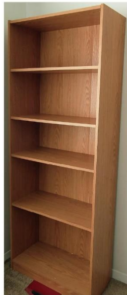
5-shelf Book case, 28" x 71"; $10