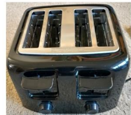
4-slot toaster, $5