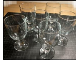
Wine glasses, short stem, set of 6 for $7