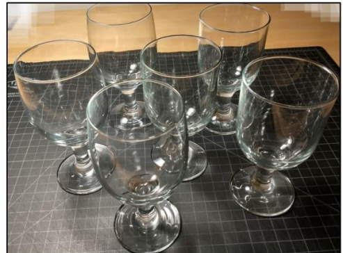
Set of six short-stem wine glasses; $7