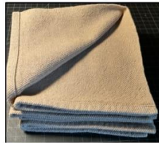
Cloth dinner napkins, never used, 4 for $4