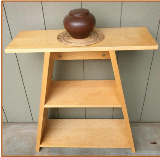
Decorative wood shelf, 25x28 tall, $10