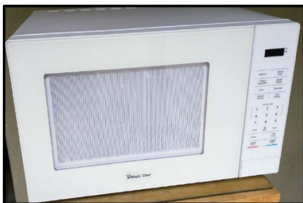
Magic Chef Microwave, like new, 1100 watts and in perfect condition! $25