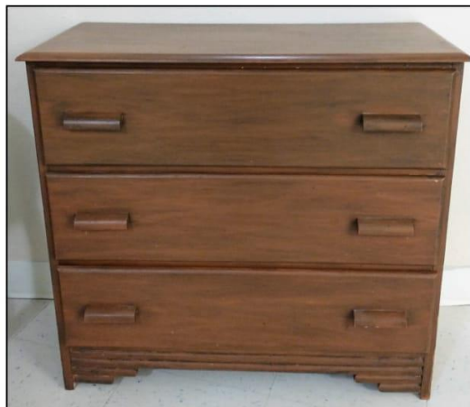
3-Drawer chest of drawers. Real wood, not particle board. 30" wide x 28" high x 13" deep. $20.