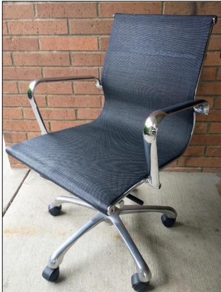
Chrome & black mesh desk chair, comfortable and stylish, $20