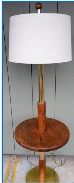
Lamp & table; $10