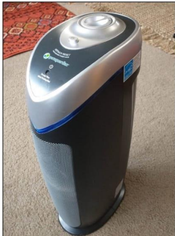
Guardian Air Cleaning System $10. Has both HEPA and charcoal filters for improved air quality.