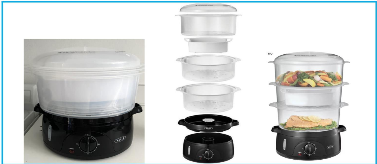
Bella 9.5-qt. 3-Tier Food Steamer (like) new condition. You can steam/cook 3 items at one time! $15 (new sells for $45-$55) User's manual included.