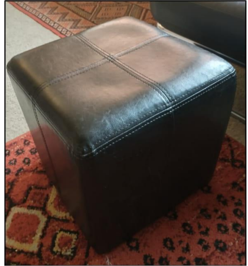
Black imitation leather ottoman, 14" cube, $5