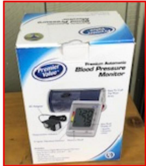
Think you're about to blow? This monitor will help you know! Be sure! $10

Items available on a first-come first-served basis. 100% of all proceeds are donated to the Samaritan Village Transportation Fund. To donate or purchase, please contact Vic Russell at 541-745-8748 or Diane Kinman at 206-453-5800.