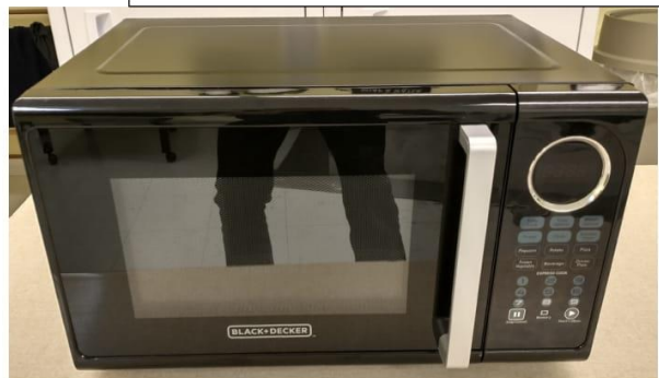
900-watt Black & Decker Microwave, in excellent condition! $20

If you need something specific, ask Vic.