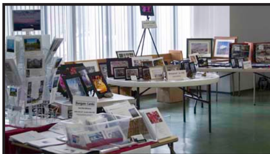
Good Samaritan Festival of Art