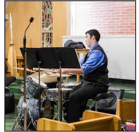
Sundays@3 Concert — Willamette Singers