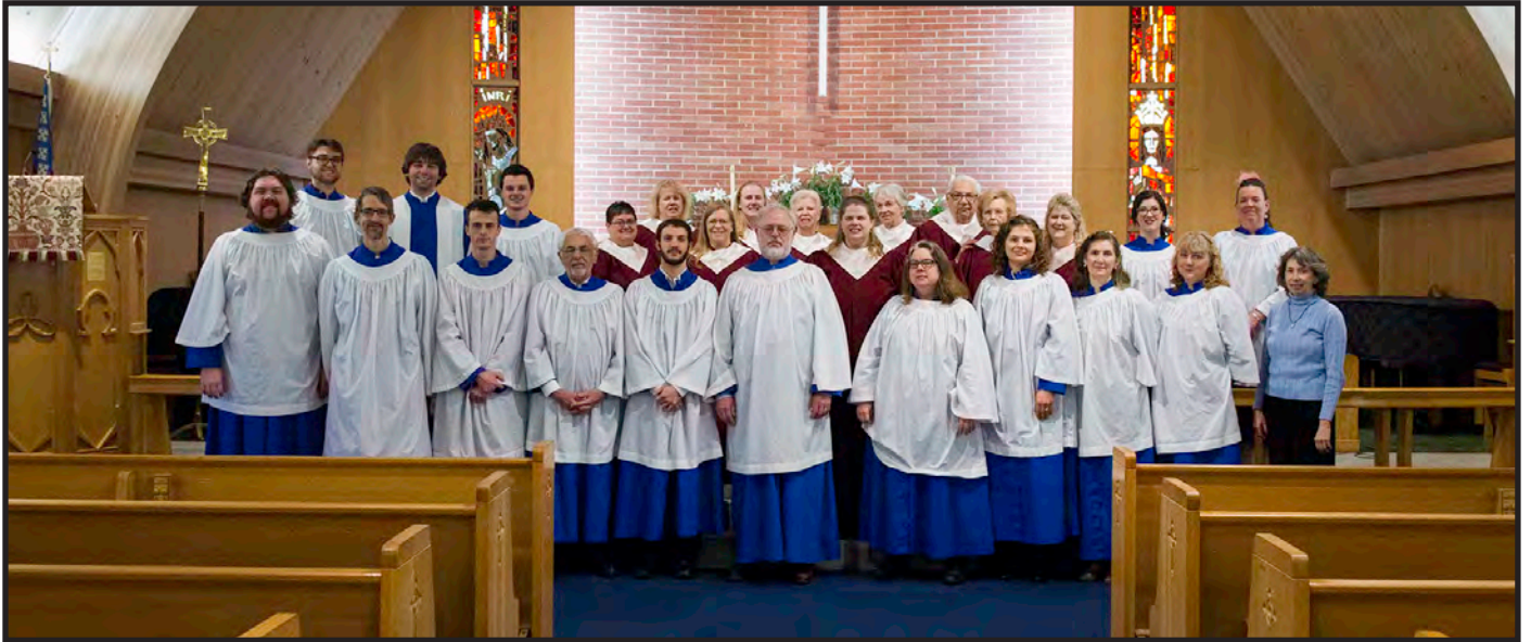
Thank you choirs for the great music performed throughout the Easter period