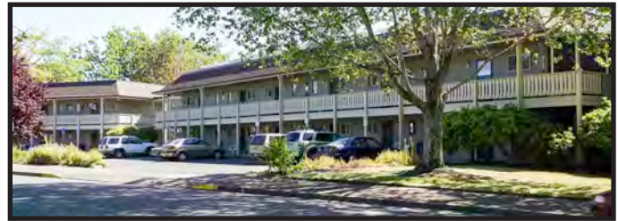
View from the Village

So far the construction here at the Village is going fairly smoothly. As in all construction projects, this one has had some bugs in it. They are being worked out gradually. By the way, we are also renovating parts of the kitchen later this year, acquiring a new hood over the stove, oven and hot pot areas, and then a walk-in refrigerator will be constructed to make the kitchen even more efficient. Meanwhile our kitchen staff is working diligently to get the residents fed a delicious lunch in the best way possible. We are grateful for Raul and Angie and the rest of the kitchen staff.